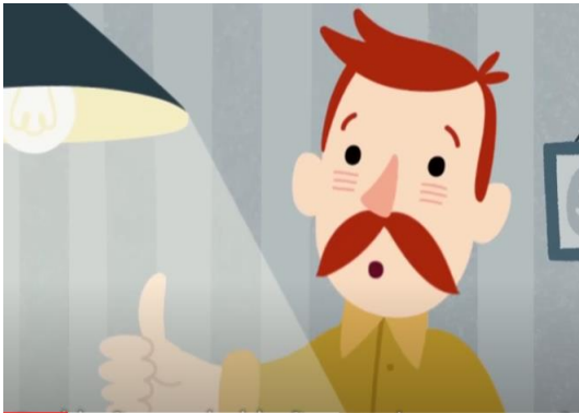
Finger Family Song