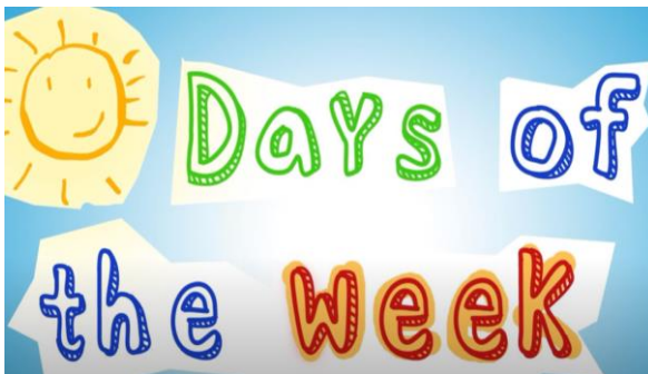
Days of the Week