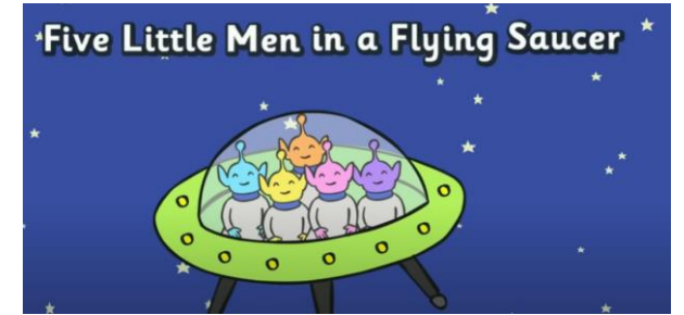
Five Little Men in a Flying Saucer