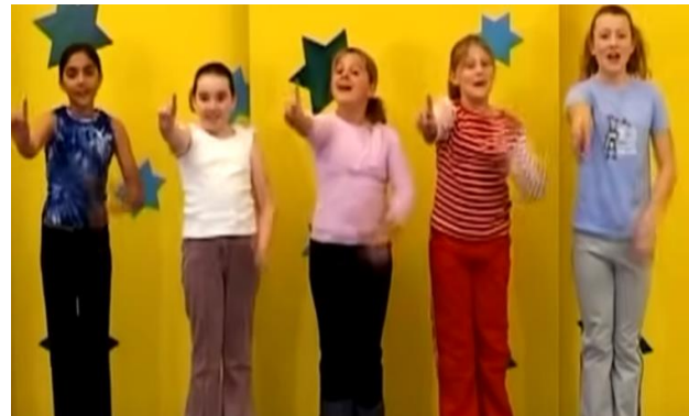
One Finger One Thumb Keep Moving