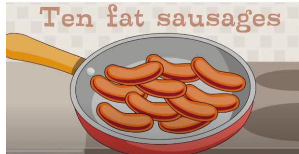
Ten Fat Sausages