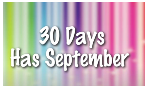
Thirty Days has September