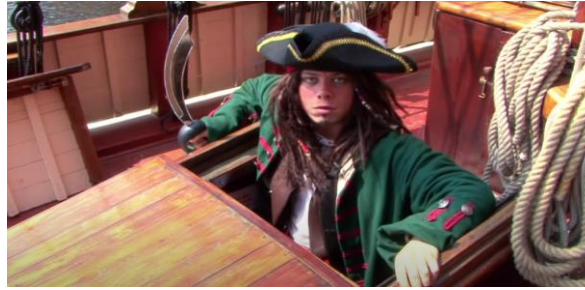
When I was One- Pirate Song