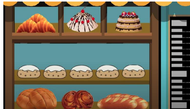
Five Currant Buns