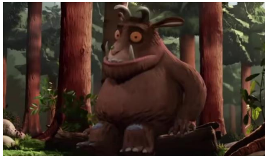
The Gruffalo Song