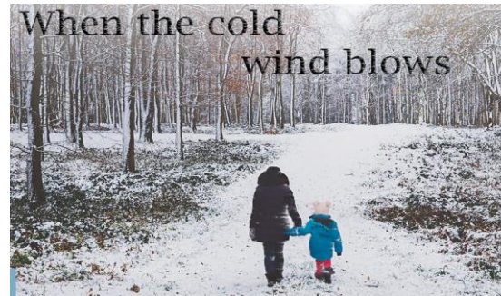
When the Cold Wind Blows