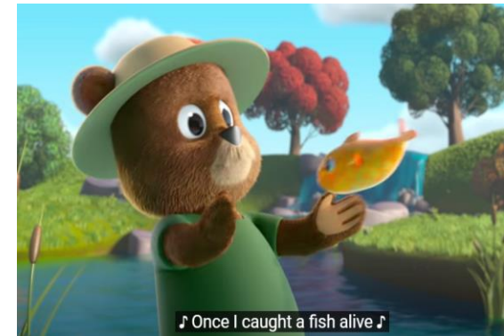
1,2,3,4,5 Once I caught a Fish Alive