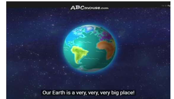
Continents and Oceans