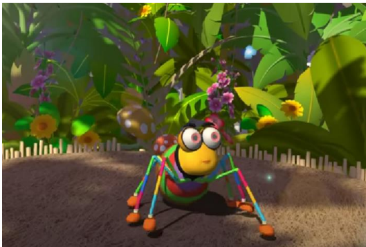
Incy Wincy Spider